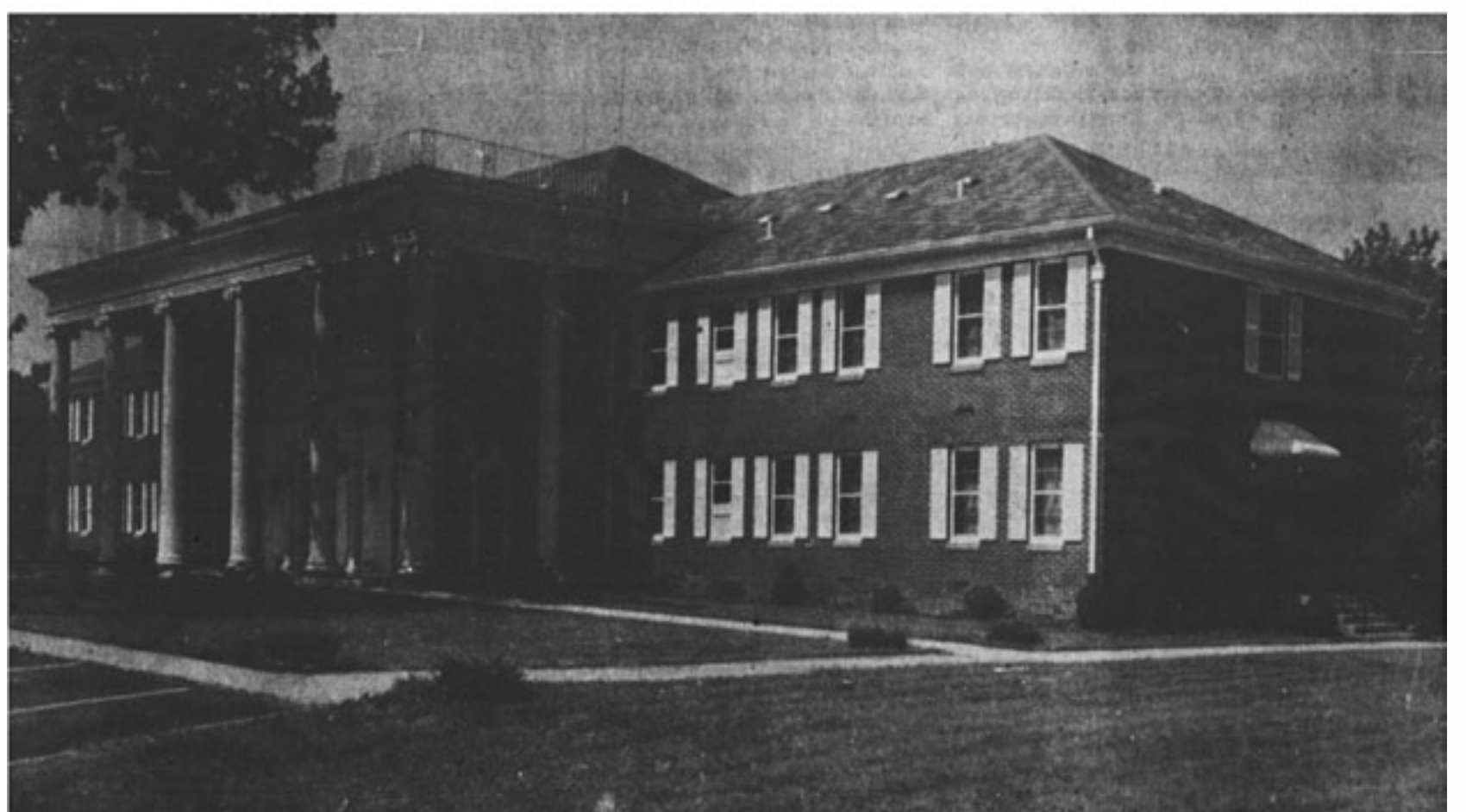
INTERNATIONAL HOUSE ON THE JACKSONVILLE CAMPUS IS HOME TO STUDENTS FROM MANY LANDS.

The records include names, salaries, source of money, budgets, and other information.