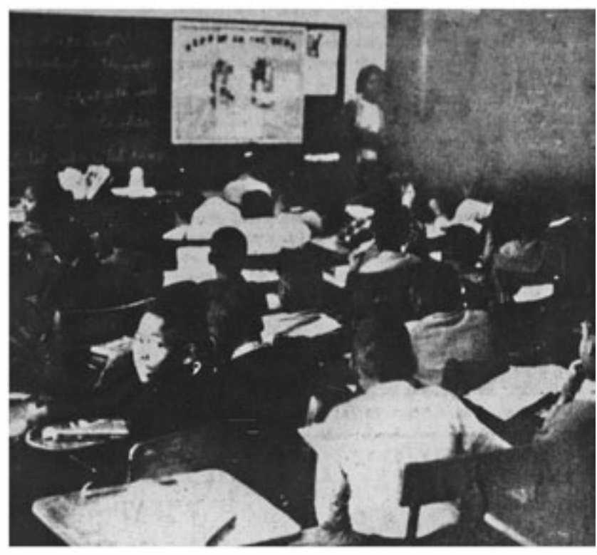
A CLASSROOM AT CAMDEN ACADEMY IN WILCOX COUNTY.