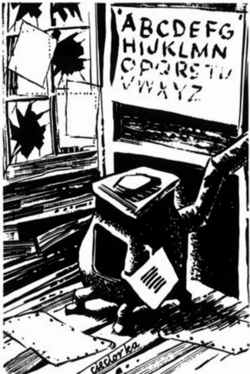
COLLEGE STUDENTS WENT DOOR-TO-DOOR IN BIRMINGHAM LAST MONTH TO CONVINCING PARENTS TO TAKE THEIR CHILDREN OUT OF SCHOOLS LIKE THIS ONE AND SEND THEM TO DESEGREGATED SCHOOLS INSTEAD.