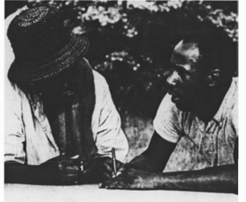
A NEW MEMBER, AT LEFT, REGISTERS WITH PANTHER PARTY

People who were illiterate or too old to stand in line sat inside the church and were helped by freedom organization members.