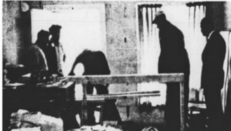
REMODELING THE OFFICE