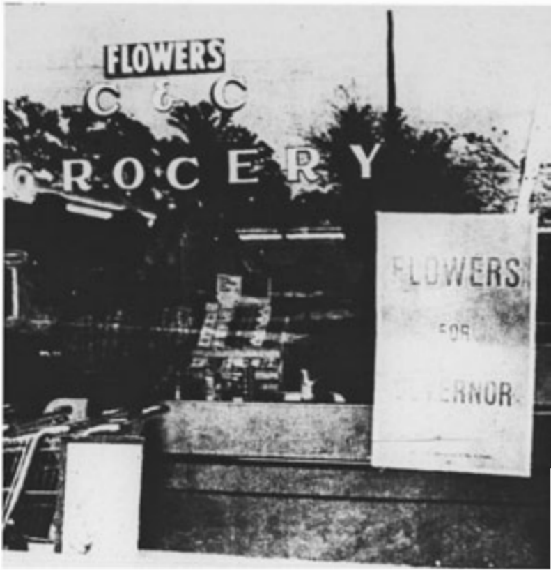
GREENALA CREDIT UNION HELPED START THIS STORE