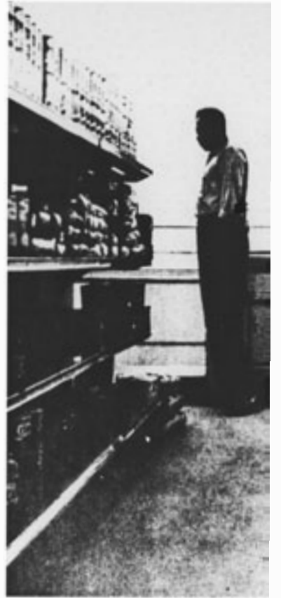
READY FOR BUSINESS