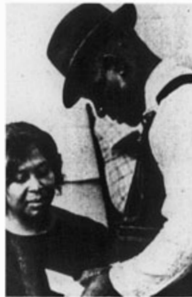
A VOTE IN THE SHERIFF'S RACE

Similar but smaller mass meetings were held in Dallas, Greene, and Wilcox counties.