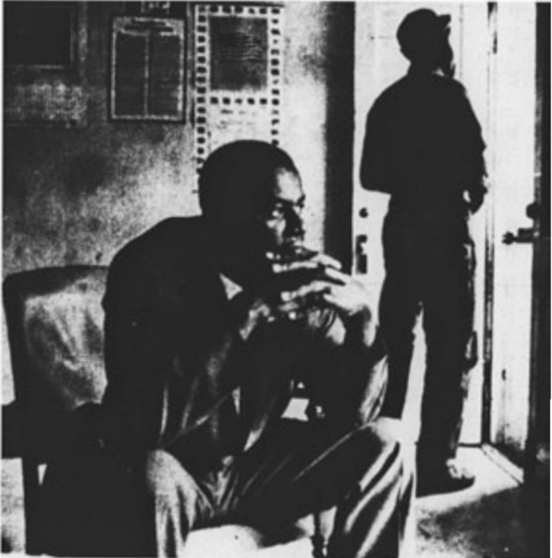
LEWIS BLACK IN CREDIT UNION OFFICE