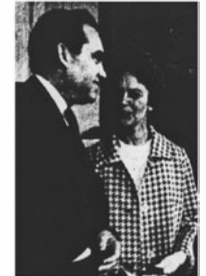
GOV. AND MRS. WALLACE