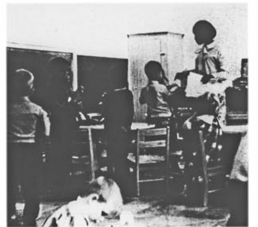
HEAD START CLASS IN MOBILE