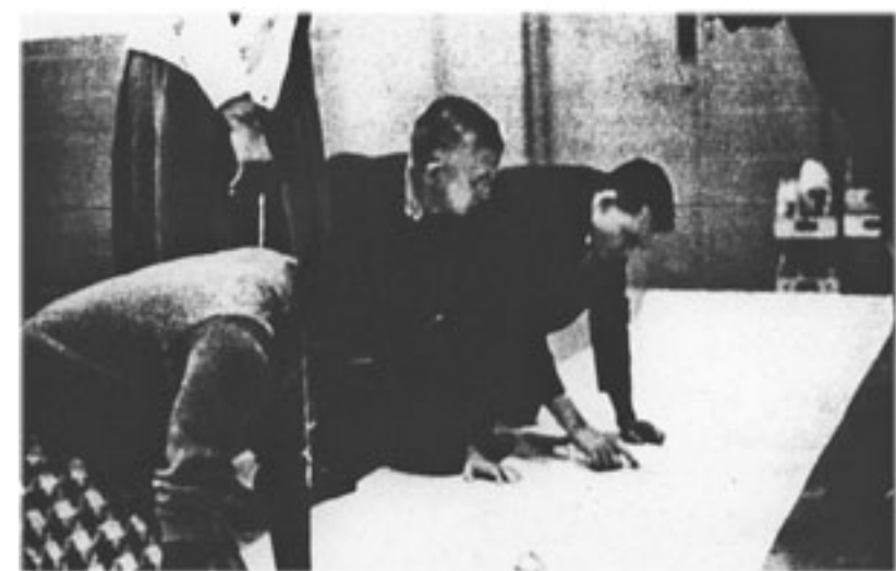
COUNTING THE WRITE-IN VOTES