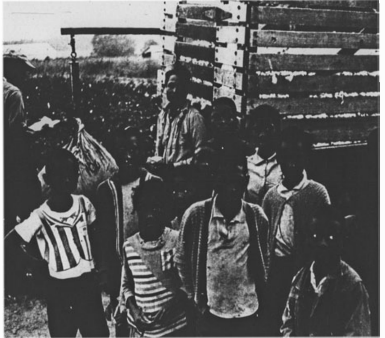
THESE AKRON CHILDREN ARE PICKING COTTON THIS FALL, INSTEAD OF GOING TO MARTIN MISSION ELEMENTARY SCHOOL.