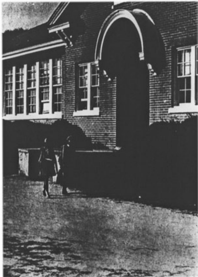
INVERNESS SCHOOL ENROLLS ABOUT 400 STUDENTS. ONLY 65 OF THEM EAT IN THE LUNCHROOM. PARENTS SAY THE PRICE IS TOO HIGH.

While the parents and school officials were talking about lunchroom prices, the students had a different complaint. "It's 30 cents for nothing," said one teen-ager. "The food is no good."