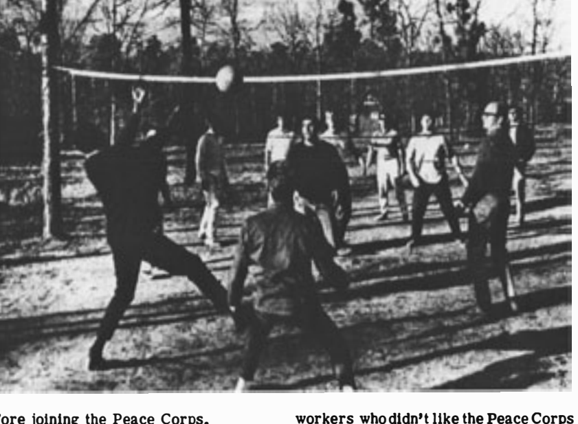
fore joining the Peace Corps.

"But I'm happy I got Africa," he said. "It has a great potential for the development of human and natural resources."