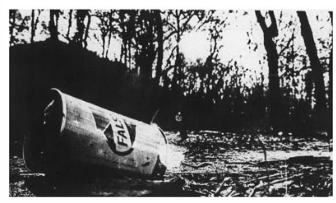
SEEN IN PASSING