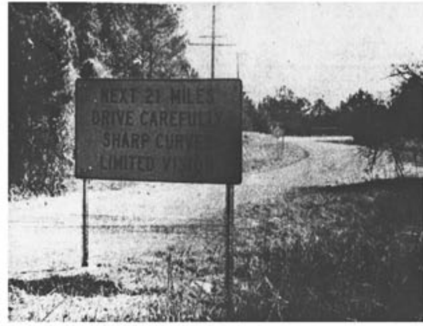
SCENE OF HIGHWAY DEATH