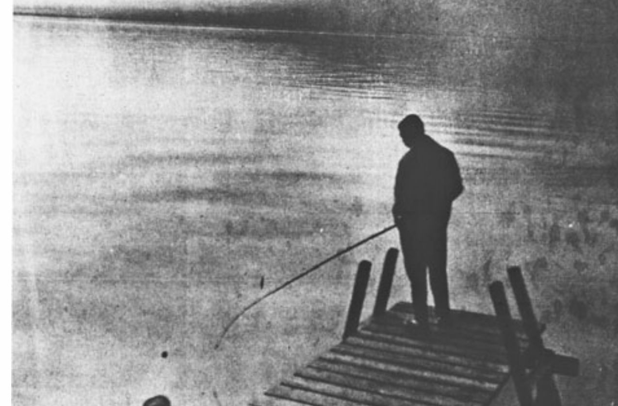
TIME OUT FOR FISHING AT BAYTREAT CAMP

"We've got to change that," was the reply. "You've got to tell the middle class that change is coming, and tell the poor that they're going to do it!"