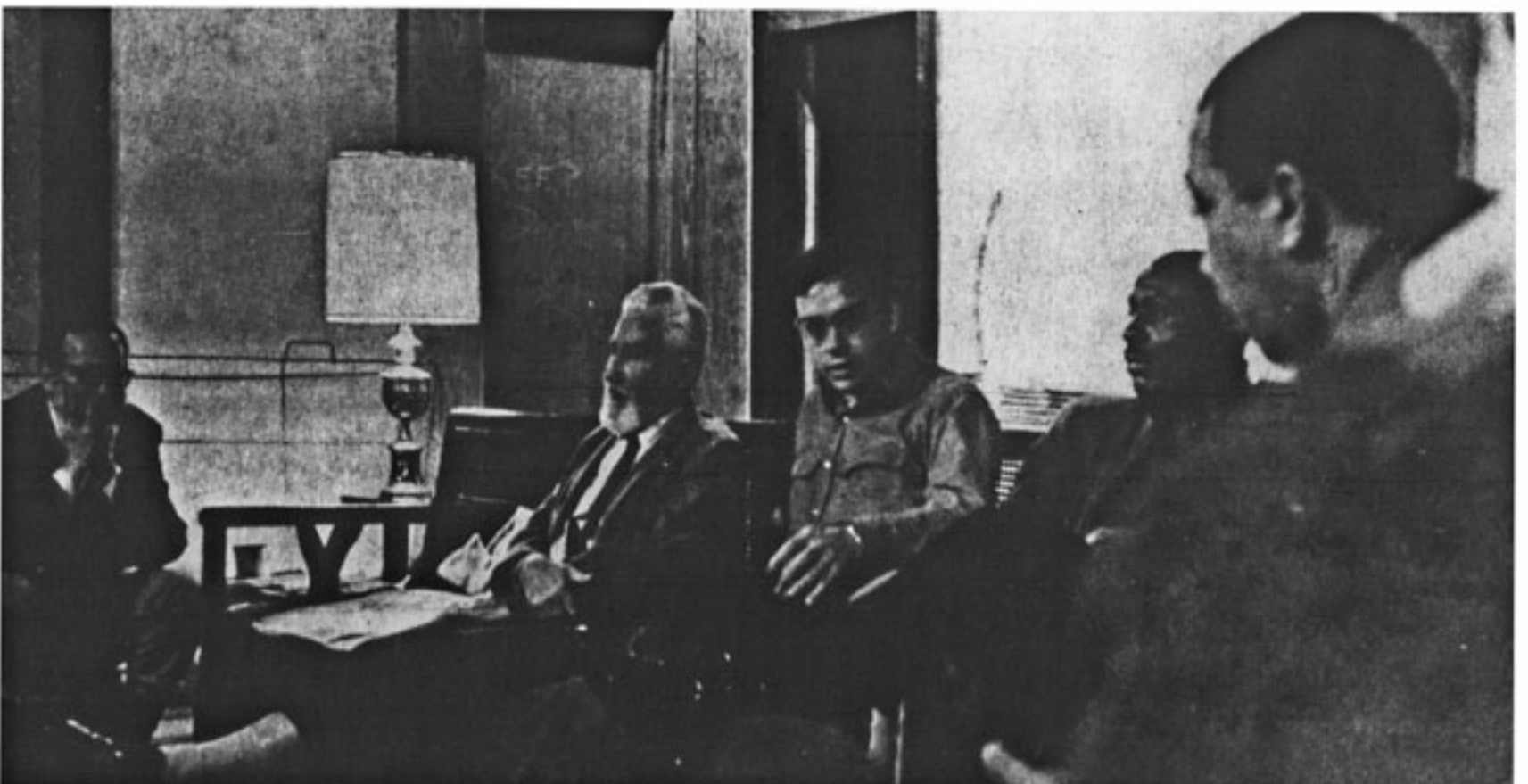
TALKING ABOUT THE CHURCH AND CIVIL RIGHTS

But those who stayed heard the Institute teachers insist that the "new" church will be responsible for future movements, and eventually, a revolution in civil rights and the whole structure of American life.