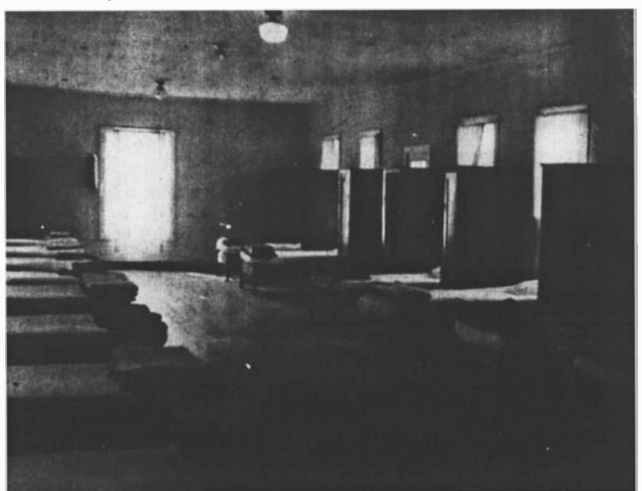
THE NEGRO BOYS' DORMITORY

Many children even said they liked staying at the home. "The food's good," explained one thin boy, reluctantly looking away from the television set for a moment, "It's all right here."