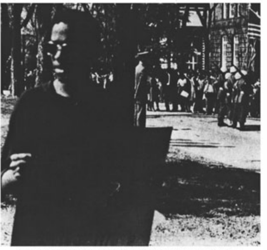
THE SIGN SAYS, "NO VIET CONG EVER CALLED ME A NIGGER"

Suddenly, half a dozen people carrying anti-war signs began threading their way through the crowd. The pickets' placards said things like "We protest the draft," and "No Viet Cong ever