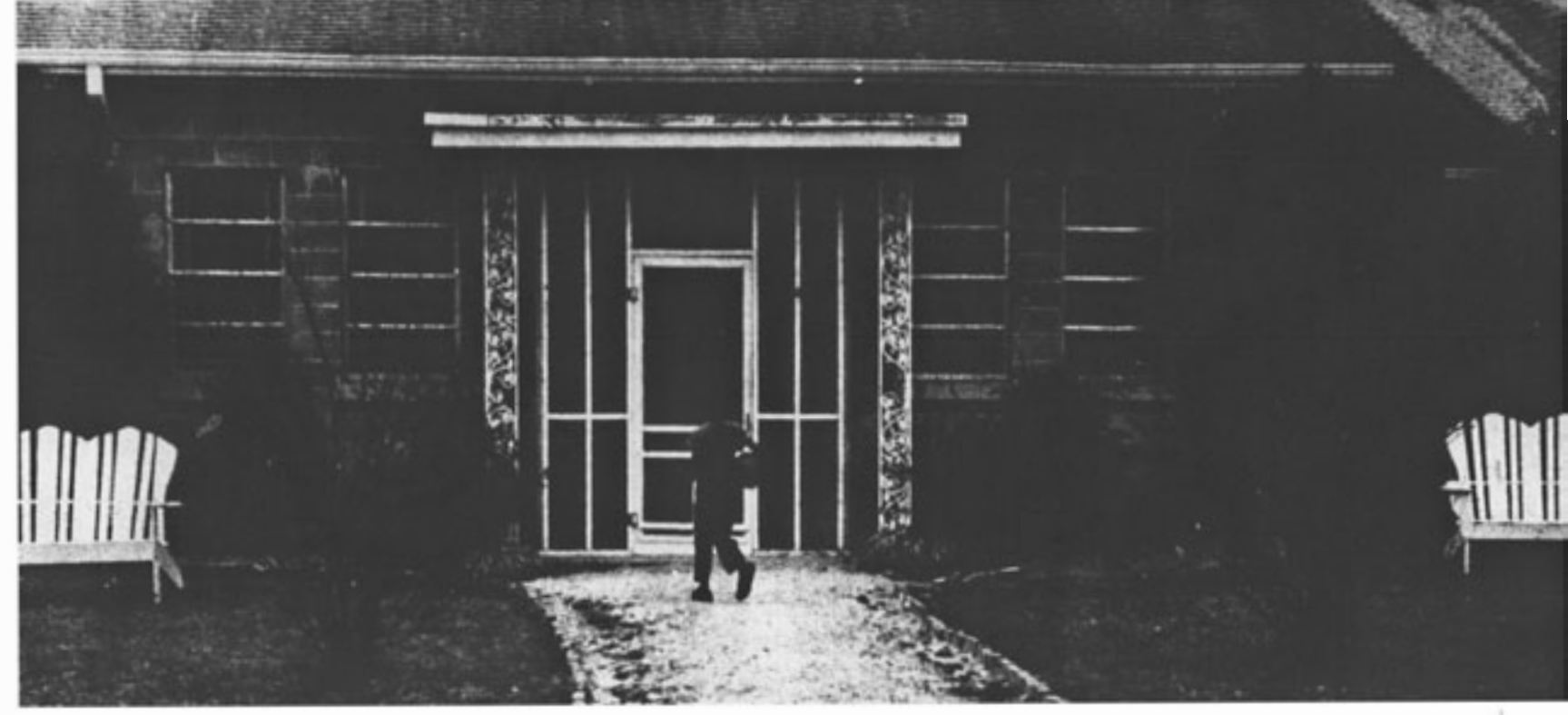
THE HOME FOR NEGRO BOYS