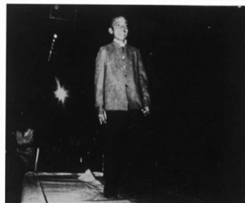
MEN'S FASHION SHOW IN MONTGOMERY