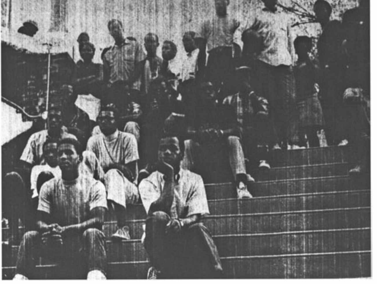
STUDENTS LISTEN TO TUSKEGEE INSTITUTE CANDIDATES

"We'll probably raise them as show birds," Wright said.