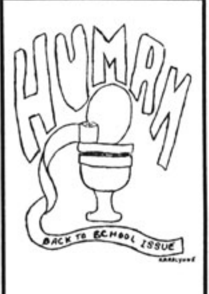
HUMAN'S FRONT PAGE

dent, said the publication, called Human, "was started primarily as an